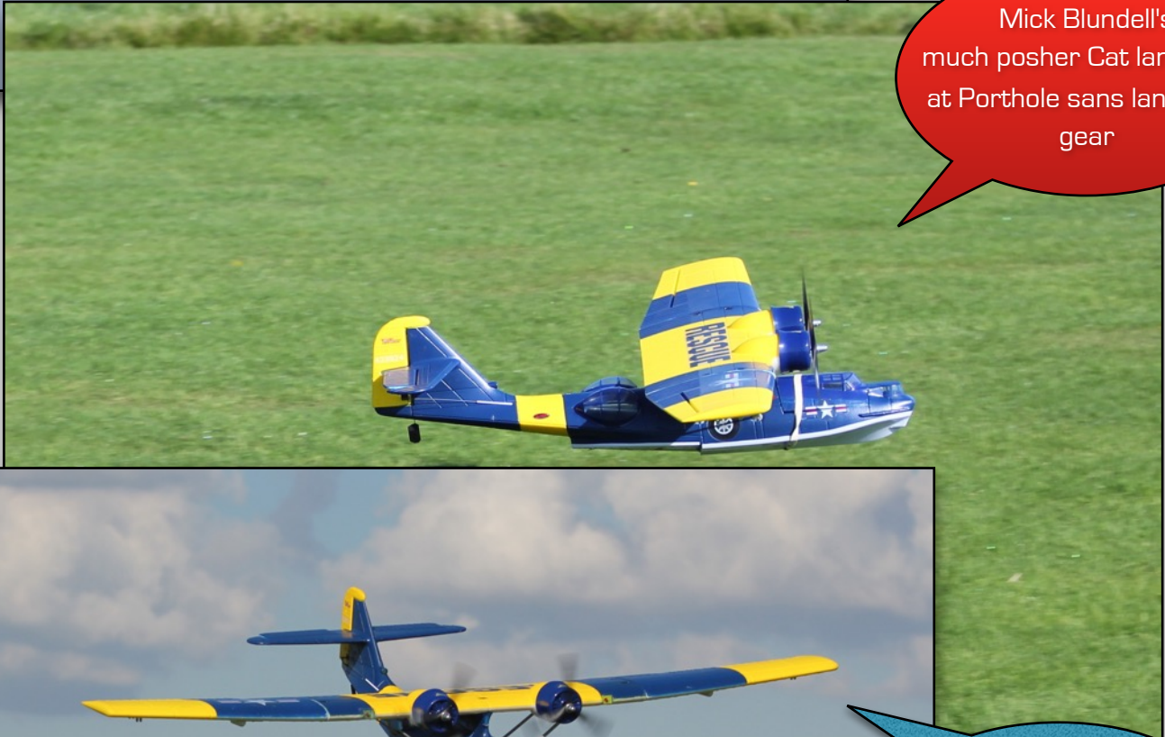
Mick Blundell's much posher Cat landing at Porthole sans landing gear