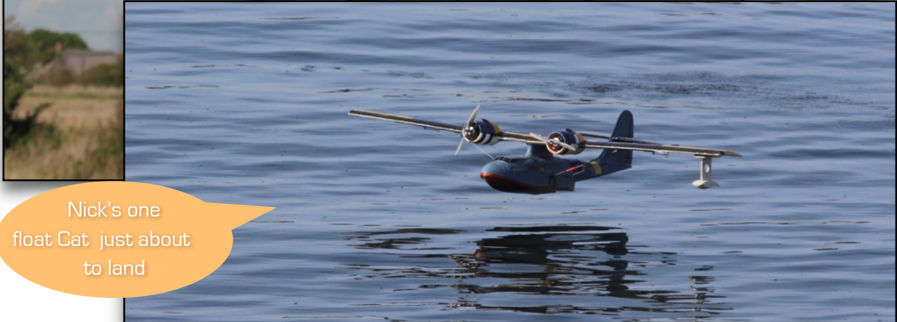
Nick's one float Cat just about to land