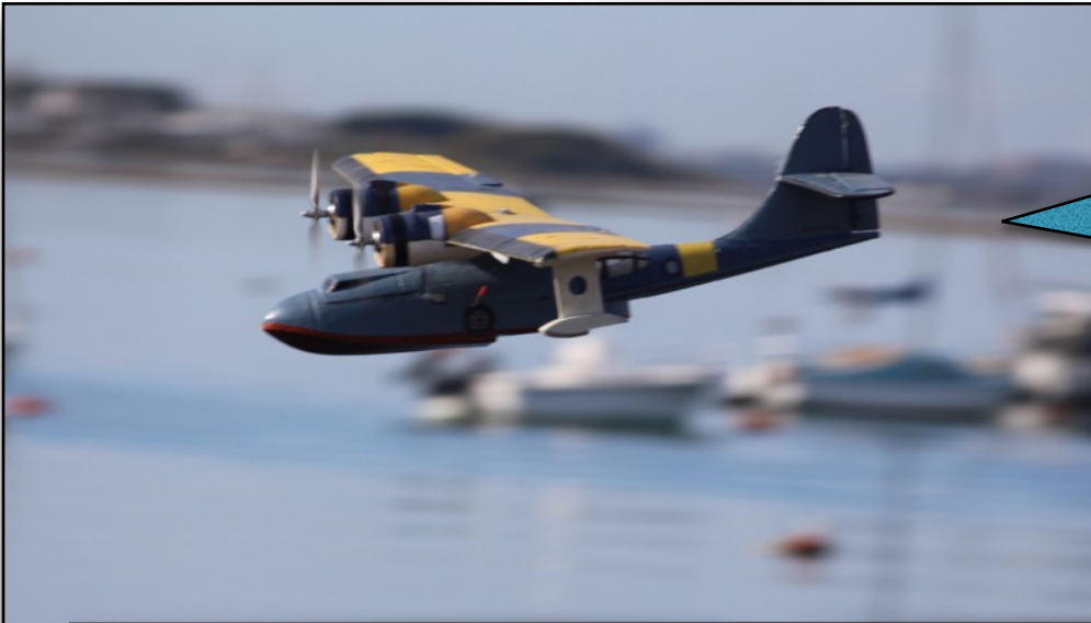
Nick Gates' Cat, an eBay special, doing a fly-by over Emsworth harbour