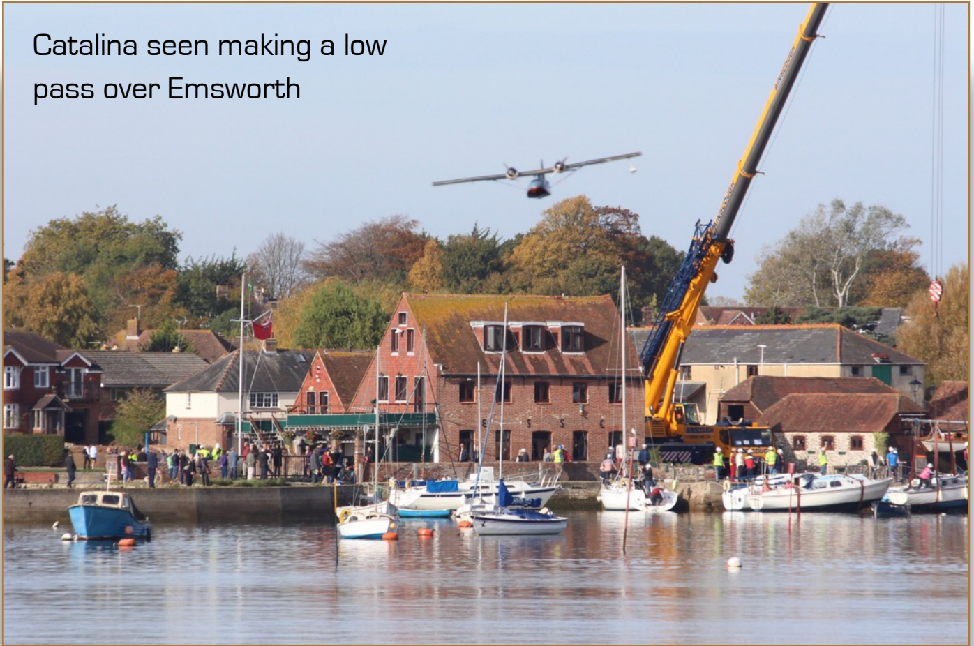
Catalina seen making a low pass over Emsworth