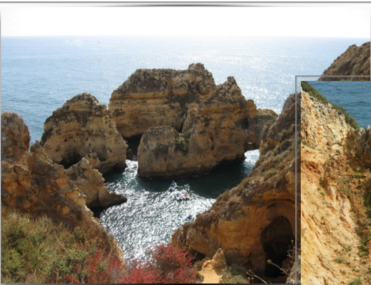
Lagos Rocks Portugal