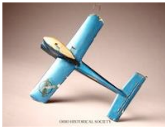
Model built by Neil Armstrong around 1950 ~ 1955