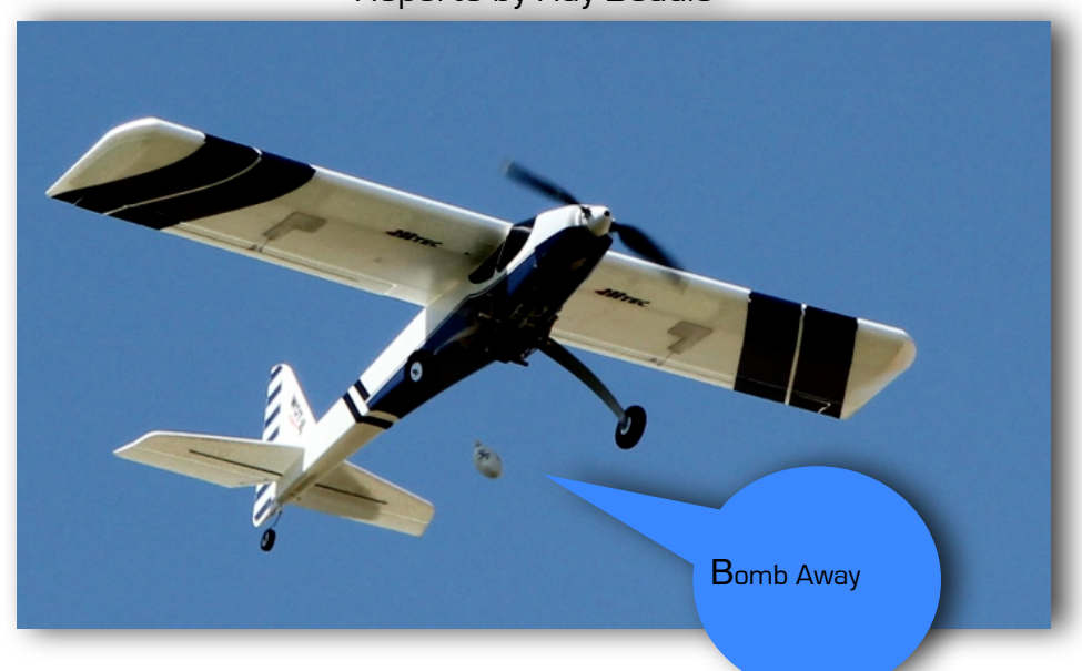
I/C Climb & Glide Competition 2013

Saturday 20th April was lovely day, sunny with a light wind