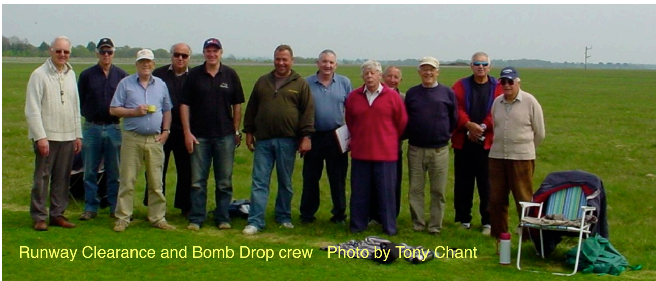
Runway Clearance and Bomb Drop crew