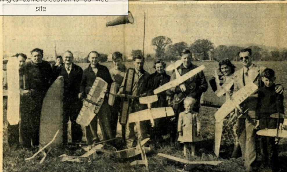
A variety of craft made by themselves was displayed by these members of Chichester and District Model Aeroplane Club at one of their recent meetings near Goodwood Motor Racing Circuit.