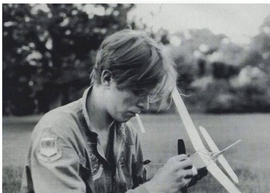
David Bowie – in free flight

The world of music can respond with a killer blow here with the UK's very own David Robert Jones aka David Bowie to begin. The Thin White Duke was very much a keen aero modeller and indulged his passion for the hobby throughout his life when not creating a series of personas and what many consider some of the finest popular music ever created.