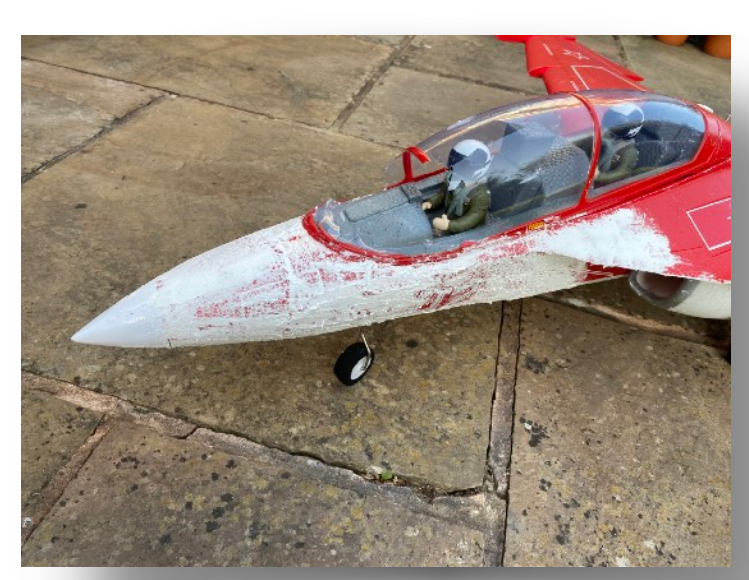
13. As already stated, expanded foam can give a bubbled-up appearance, so a layer of filler applied over the area, then sanded down, can help achieve a smoother surface.