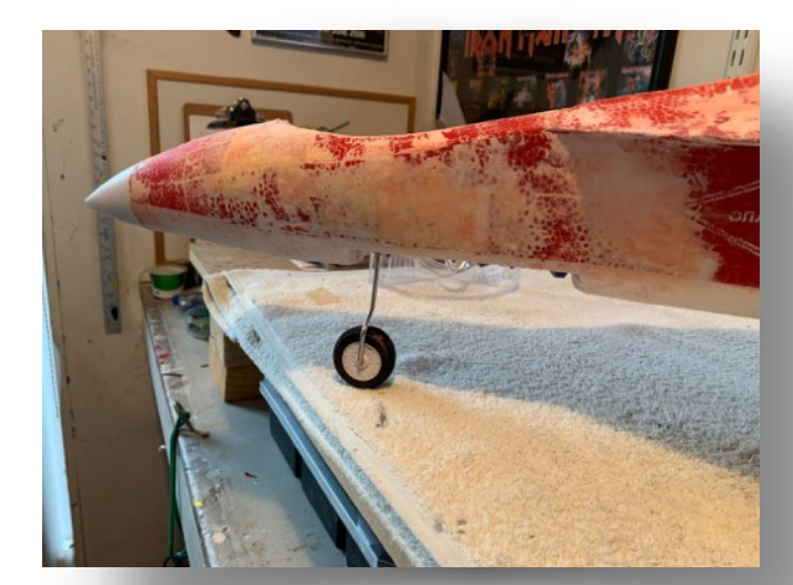
15. Repainting comprised several coats of colour-matched matt emulsion from B&Q (Valspar). As an aside, B&Q is a great source of touch-up paint in general; all that's required is sample of the original colour and for just £3 the nice folks there will mix a good-sized tester pot which is a perfect match. The only decision to make is whether you want silk or matt.

for the icing on the cake, the restoration project passed to our resident perfectionist, Derek. His first job to improve the surface yet more was further filling using micro-balloons mixed with aliphatic resin glue followed by the application of a fine filler.