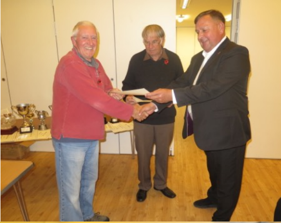
Some memories of prize giving at 2016 AGM