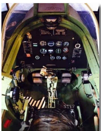
Enough to keep us occupied