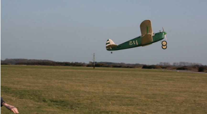
Off Up and away The Elf's maiden flight under the able control of Colin Stevens