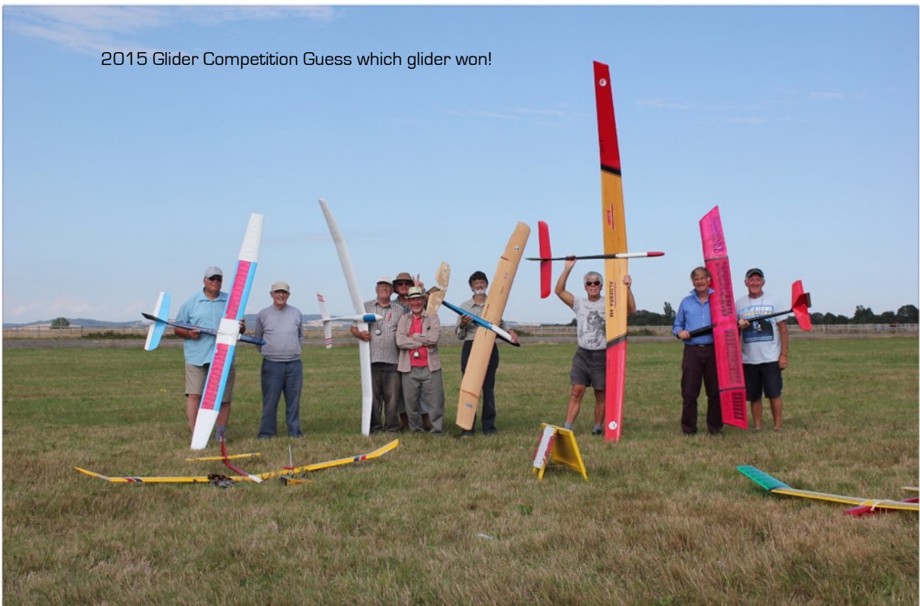
2015 Glider Competition Guess which glider won!