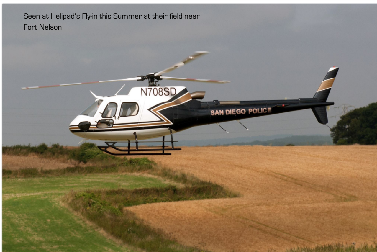
Seen at Helipad's Fly-in this Summer at their field near Fort Nelson