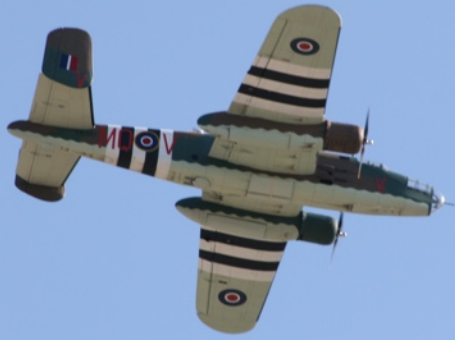
B25 in flight