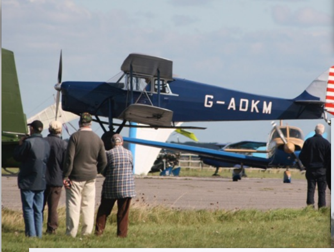
Some pictures of Help the Hero's fly-ins at Thorney 2010/12 and Colin in 2012