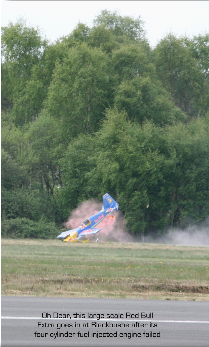
Oh Dear, this large scale Red Bull Extra goes in at Blackbushe after its four cylinder fuel injected engine failed