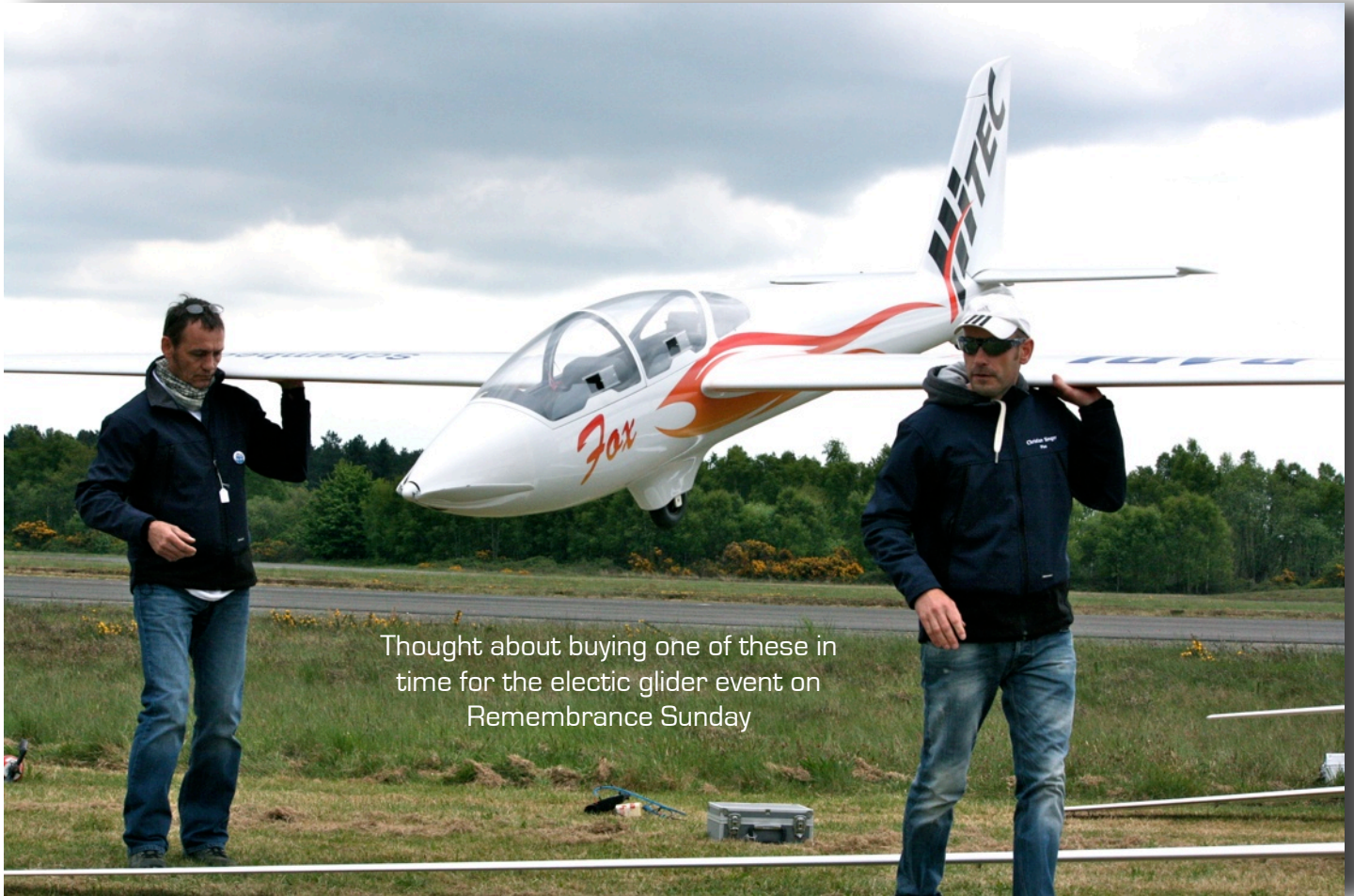
Thought about buying one of these in time for the electric glider event on Remembrance Sunday