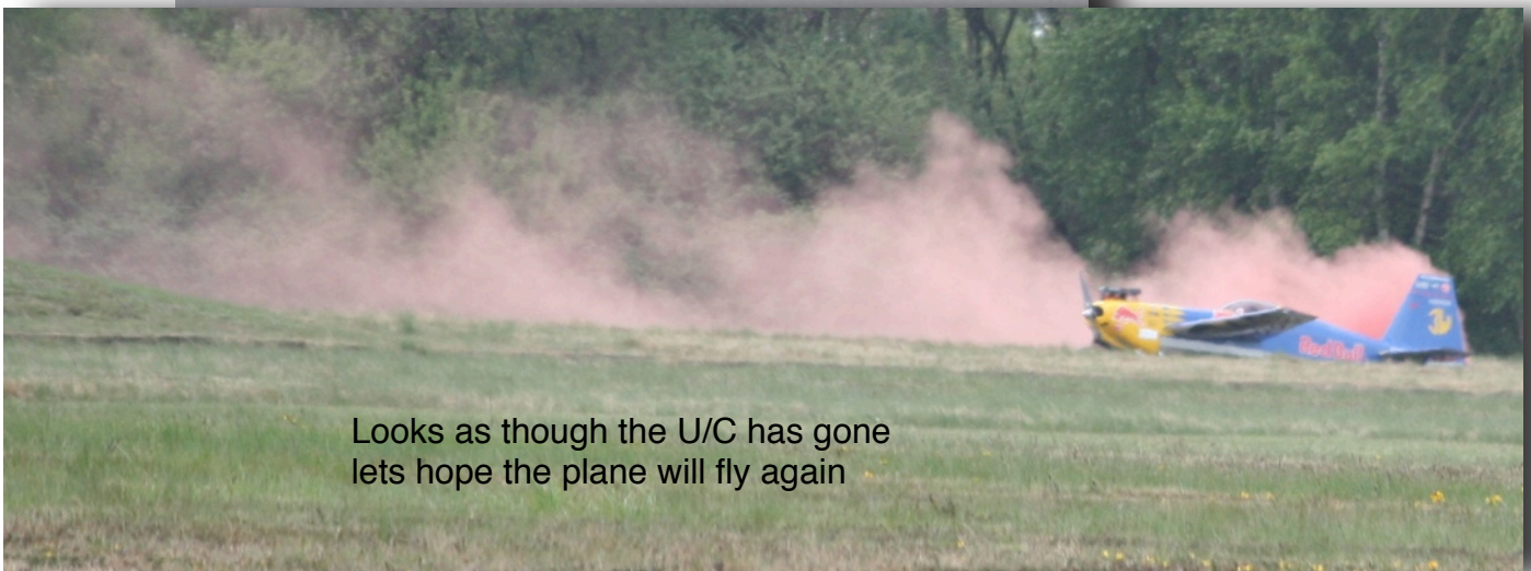
Looks as though the U/C has gone lets hope the plane will fly again