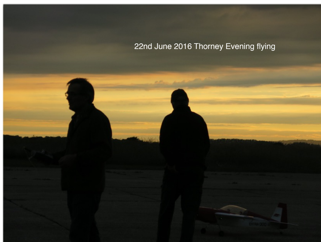
22nd June 2016 Thorney Evening flying

Warbirds theme day and general flying Sunday 10th July a small prize will be given for the most interesting/best airframe