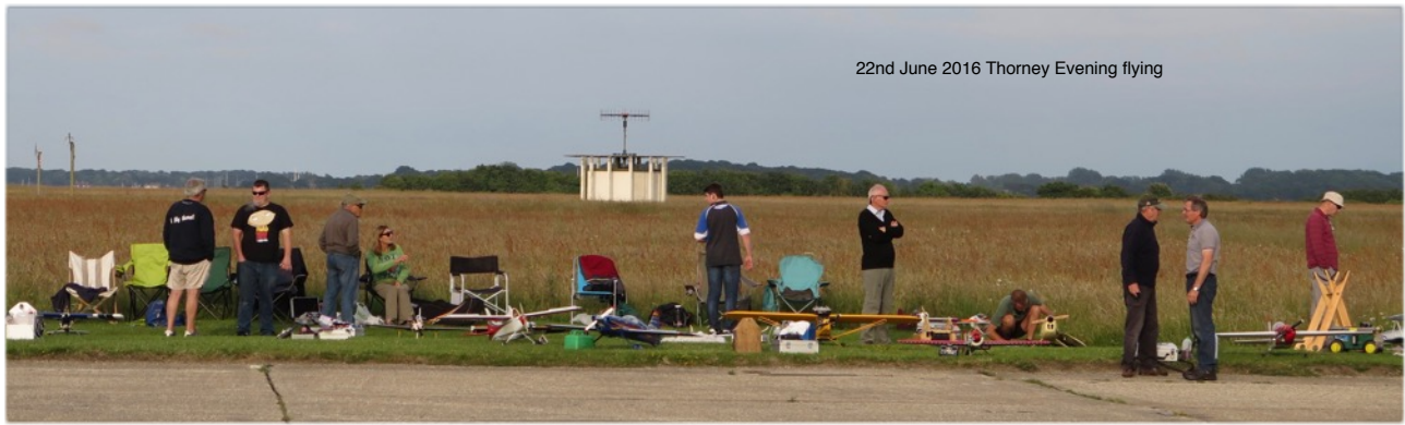
22nd June 2016 Thorney Evening flying

Last months evening flying was a great success next one is this coming Thursday 7th July positively no flying before 17.30 also the following Thursday 13th July