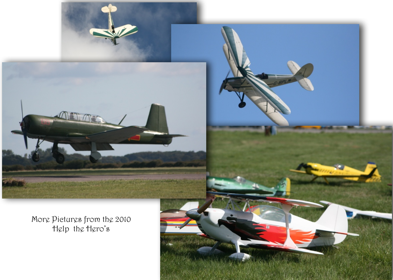
More Pictures from the 2010 Help the Hero's

Recently I have been looking at other clubs web sites and newsletters for ideas for our newsletter and web site.