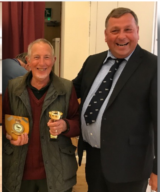
2017 Prize giving and AGM