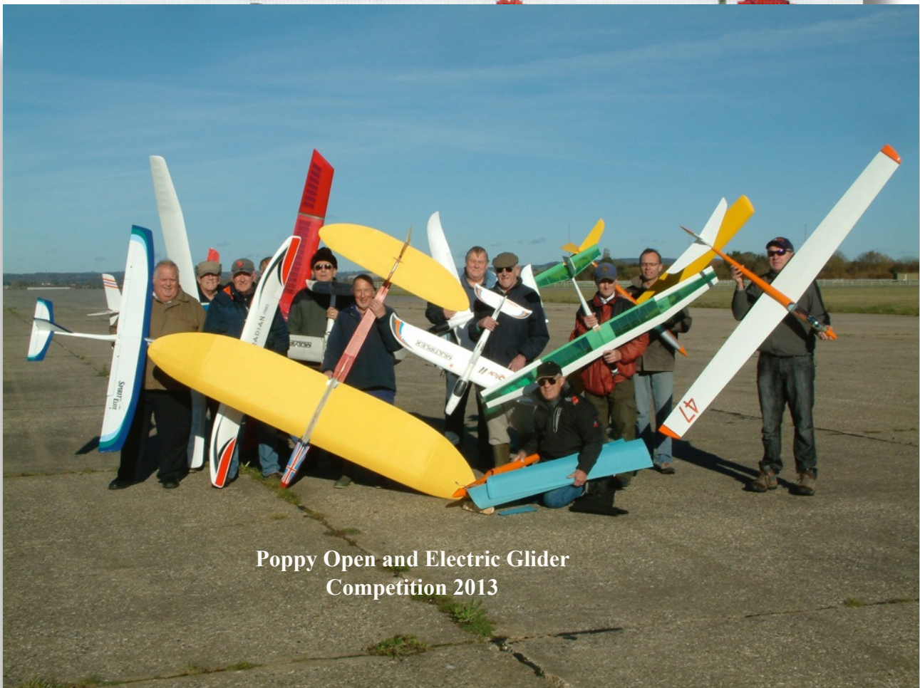
Poppy Open and Electric Glider Competition 2013