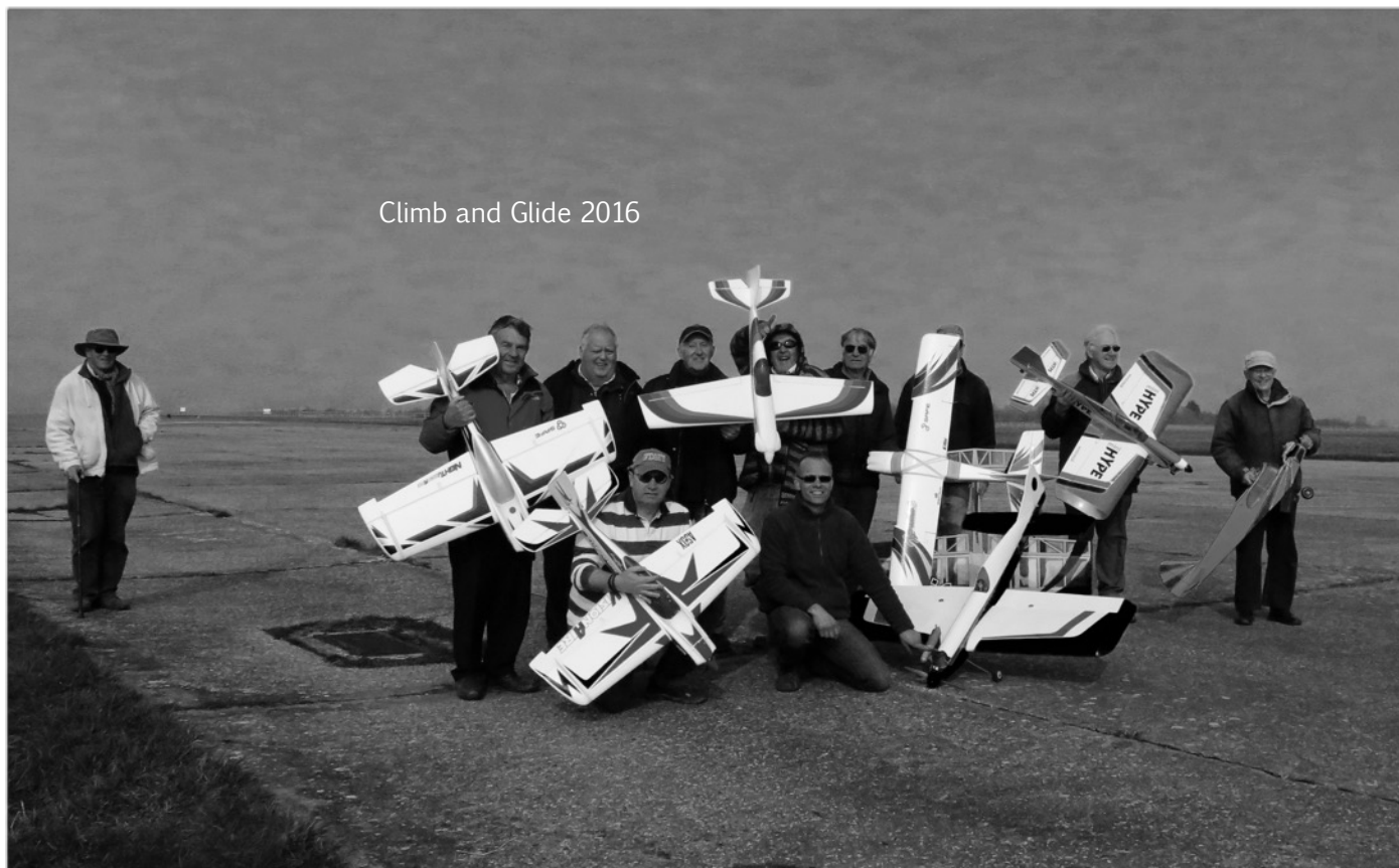
Climb and Glide 2016