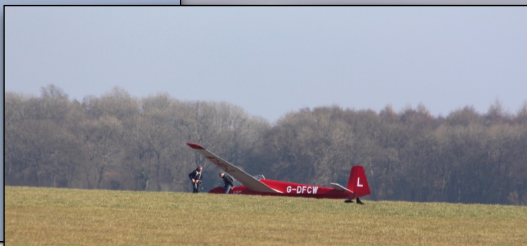
Seen at Lasham earlier this year, looks like a tow line failure whether this was an exercise or not I am not sure