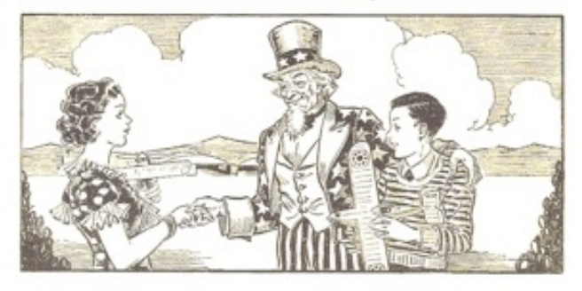
A National Organization of Air-Minded American Boys and Girls