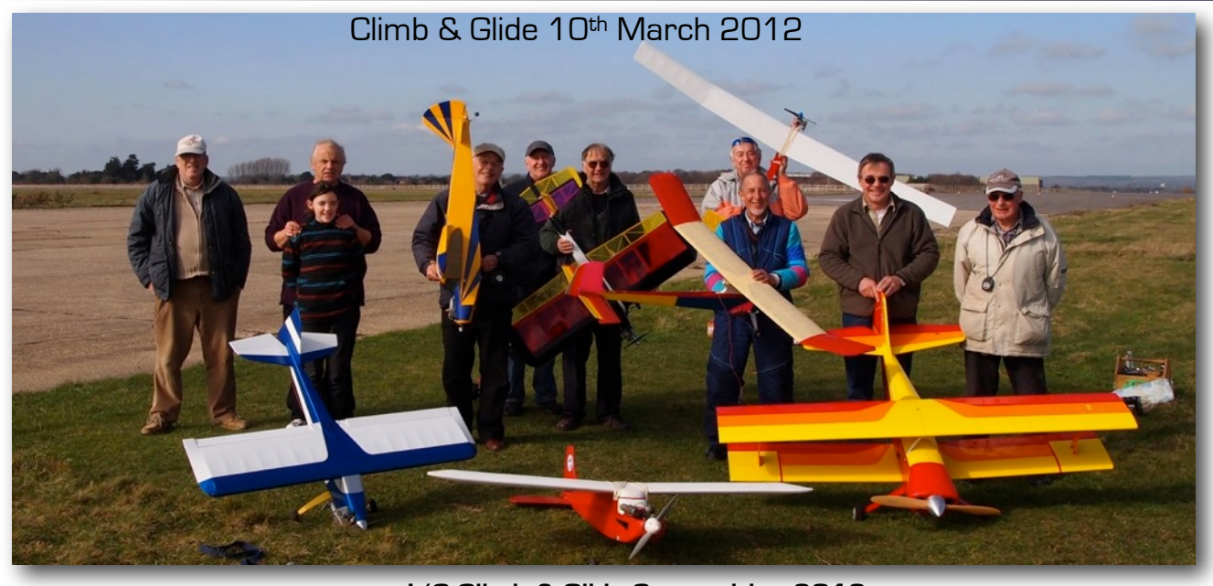
I/C Climb & Glide Competition 2012

Saturday was lovely day, sunny with a light wind from the sea.